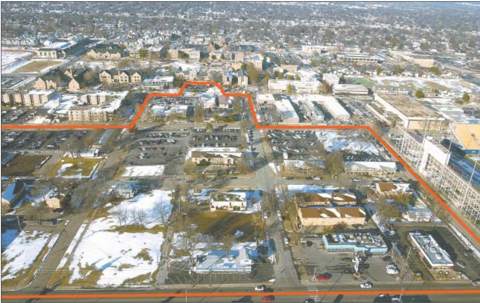
Illustration by DAVE CARMAN (Helicopter by Bill Stokley)

Architects have told University of Tulsa officials that the school's campus lacks a front door. A new plan for the campus includes a southern extension to include a landscaped oval, which will act as an entrance to the school.