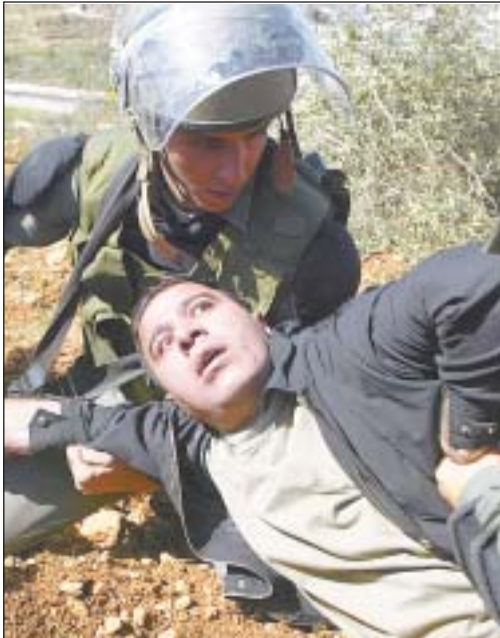
WEST BANK WOES: Israeli workers cut down a Palestinian farmer's olive grove to make way for a security barrier, setting off clashes. C-6

FORE: The Masters is set to tee it up today at Augusta. B-1