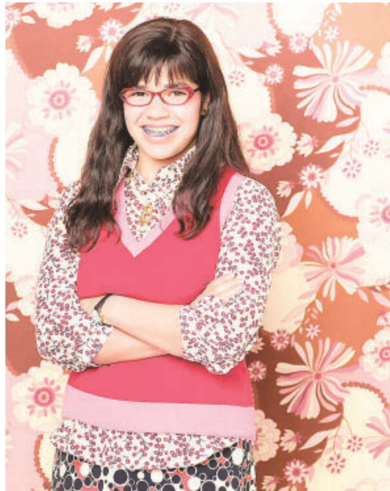
America Ferrera is "Ugly Betty."