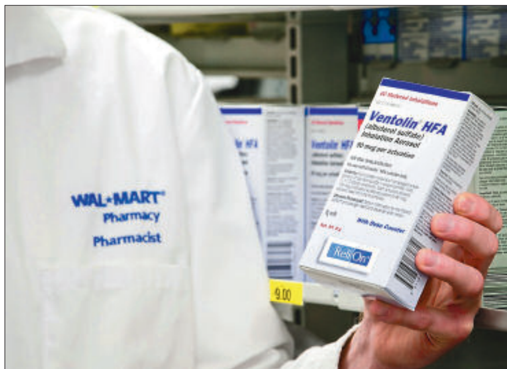
The new ReliOn Ventiolin HFA inhaler is touted as being easier on the environment.

To purchase "Only in Oklahoma," a book of collected columns by Gene Curtis, visit tulsaworld.com/OnlyinOklahoma