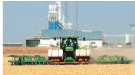
FLAT GROWTH: Many farmers were unable to overcome bad weather to take advantage of high prices in 2008. E1