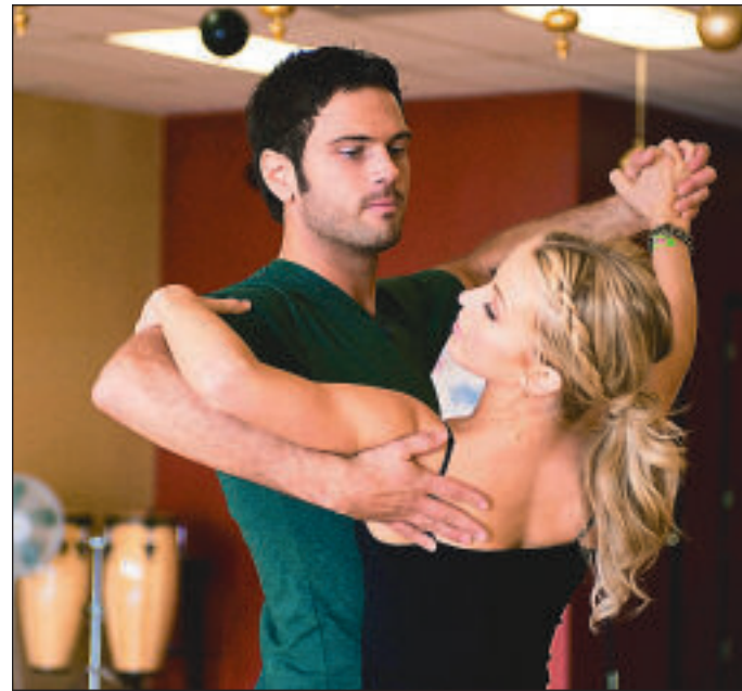
EYING THE TROPHY: Country singer and songwriter Chuck Wicks teams with girlfriend and two-time champ Julianne Hough, who returns for her fifth season on "Dancing with the Stars." 7 p.m. ABC, channel 8.